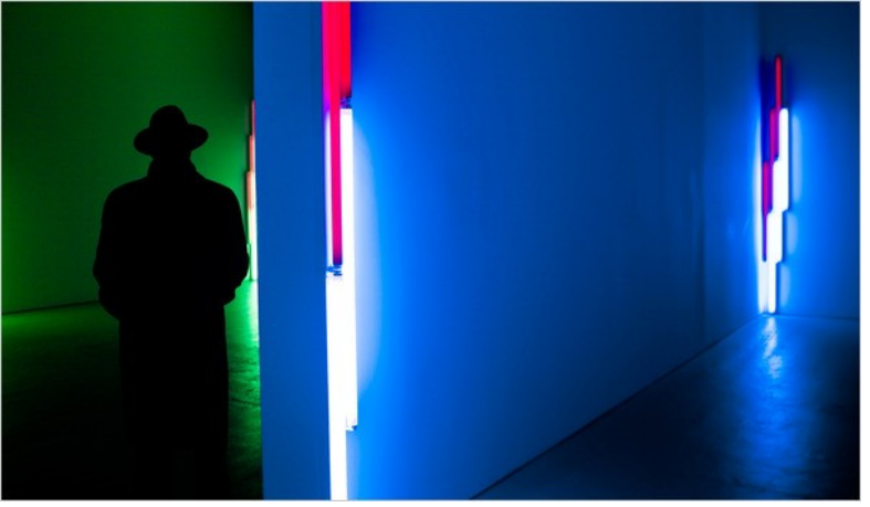
CHELSEA 37 Holland Cotter on dealers turning to old reliables. Above, Dan Flavin's light sculptures at David Zwirner.